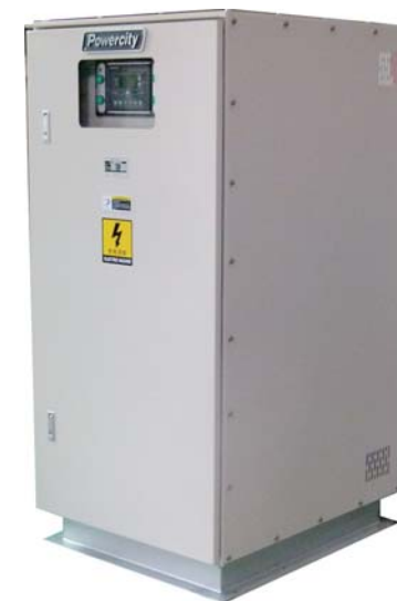
Capacity: 3200 Ampere

(Specifications are subject to change without prior notice.)