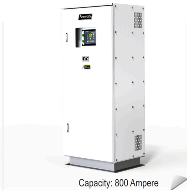
Capacity: 800 Ampere

(Specifications are subject to change without prior notice.)