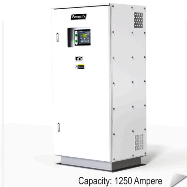
Capacity: 1250 Ampere

(Specifications are subject to change without prior notice.)