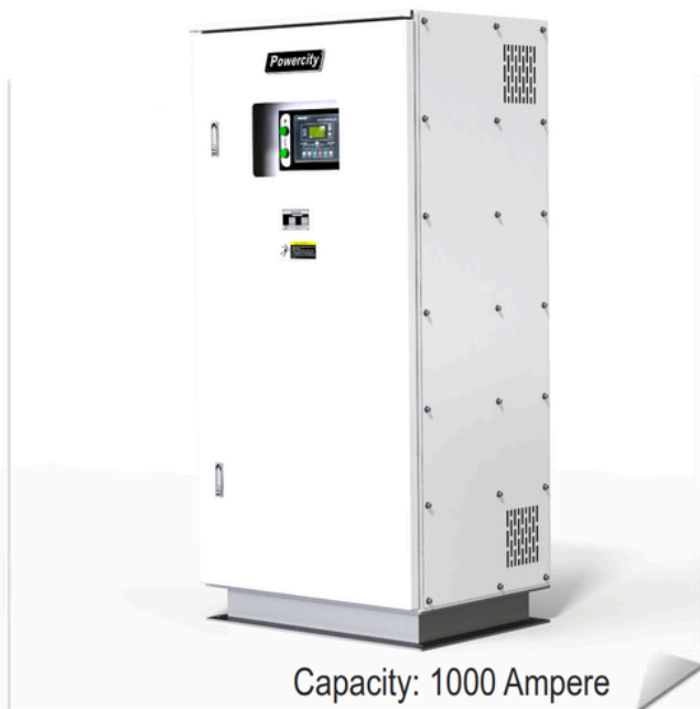
Capacity: 1000 Ampere

(Specifications are subject to change without prior notice.)