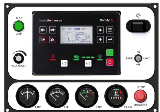
ComAp AMF25 controller